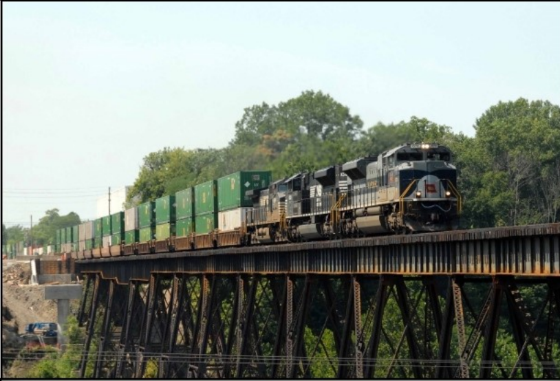
A freight train crossing the Painesville bridge.

Publication of Division 5 12049 Sperry Road Chesterland, Ohio 44026