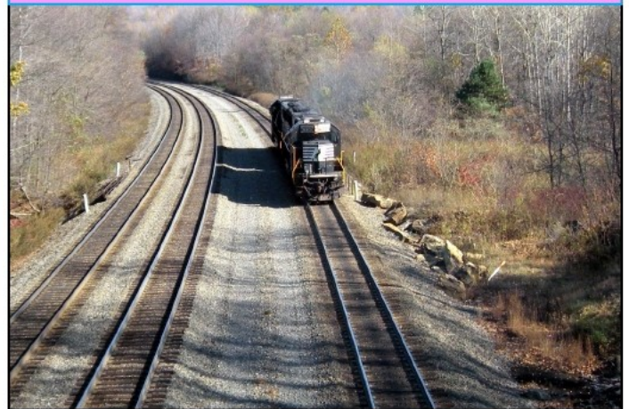
The Cassandra Cut in Pennsylvania.

T he Trainwire is always looking for an interesting article. If you have taken a trip lately, seen something interesting trackside, have a particular view point on a railroad subject or just want to participate in the Modelers Corner; then we want to hear from you. Everyone wants to be kept current on Division information, but we all enjoy an interesting article written by a member of this organization. So take your pictures and article and send them to the Editor by email and share them will all of us.