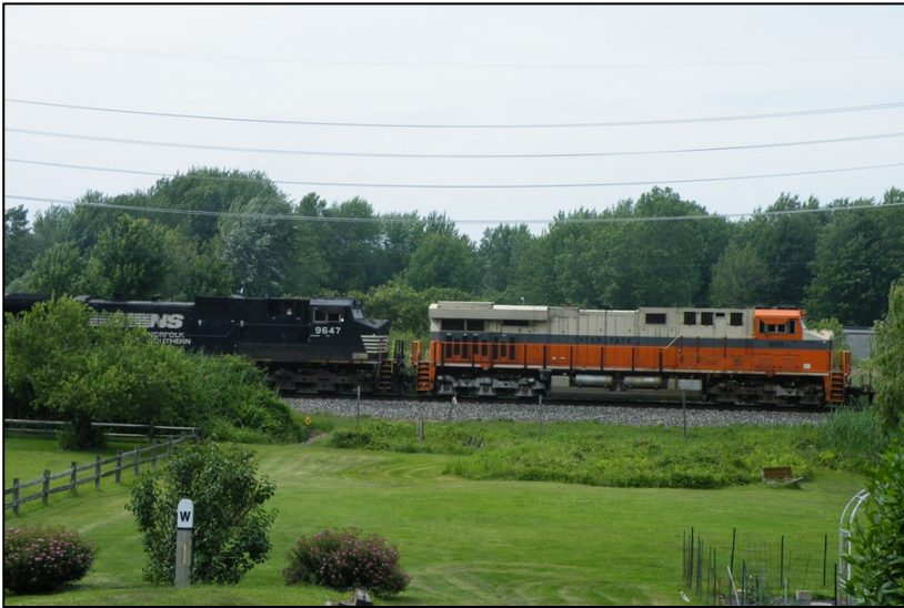
A view from Larry Novak's backyard.

Publication of Division 5 12049 Sperry Road Chesterland, Ohio 44026