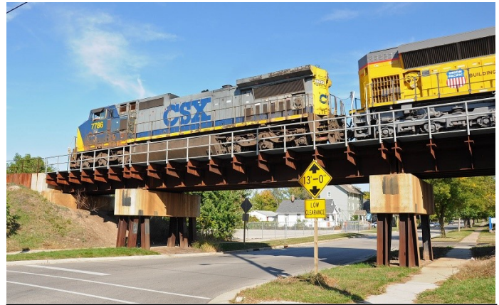
A Picture from the Internet.