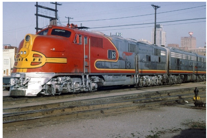
Another Picture from the Internet.

T he Trainwire is always looking for an interesting article. If you have taken a trip lately, seen something interesting trackside, have a particular view point on a railroad subject or just want to participate in the Modelers Corner; then we want to hear from you. Everyone wants to be kept current on Division information, but we all enjoy an interesting article written by a member of this organization. So take your pictures and article and send them to the Editor by email and share them with all of us.