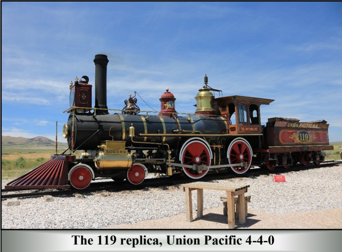
The 119 replica, Union Pacific 4-4-0