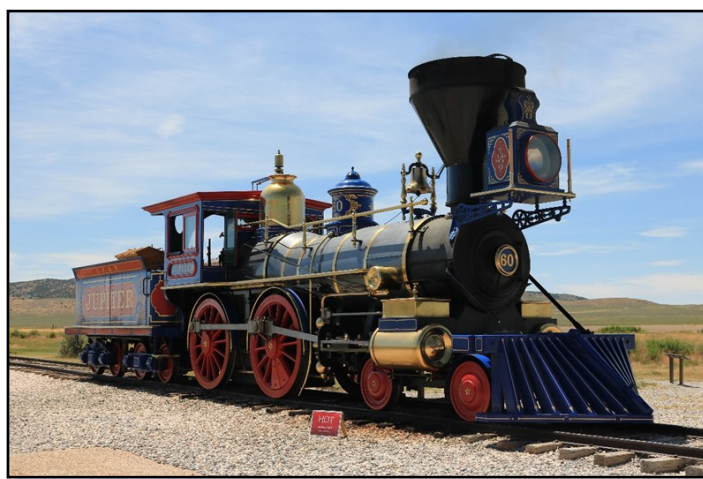
"Jupiter" replica, the Central Pacific American 4-4-0