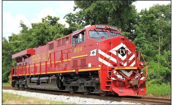
A Picture from the Internet.