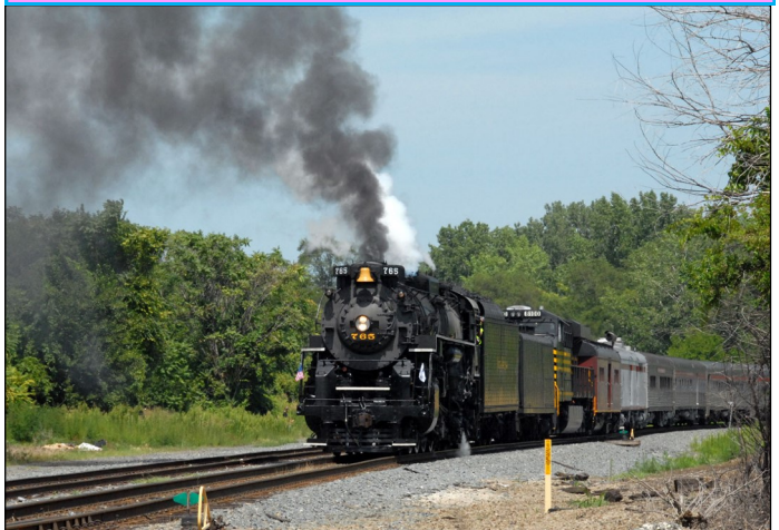
Another Picture from the Internet.

T he Trainwire is always looking for an interesting article. If you have taken a trip lately, seen something interesting trackside, have a particular view point on a railroad subject or just want to participate in the Modelers Corner; then we want to hear from you. Everyone wants to be kept current on Division information, but we all enjoy an interesting article written by a member of this organization. So take your pictures and article and send them to the Editor by email and share them will all of us.