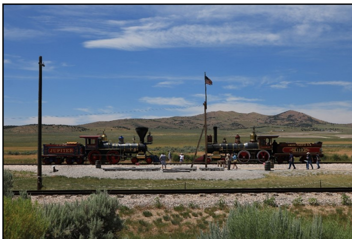
Promontory Point, Utah

I attended one layout tour featuring a D&RG HO setup, and an N Scale Milwaukee road theme; both were superb nearly complete full-basement layouts. Another interesting tour took us to Promontory point (see accompanying pix) to visit the site of the driving of the Golden Spike 150 years ago in 1869. Several tour visitors among us participated in the ceremonial re-enactment.