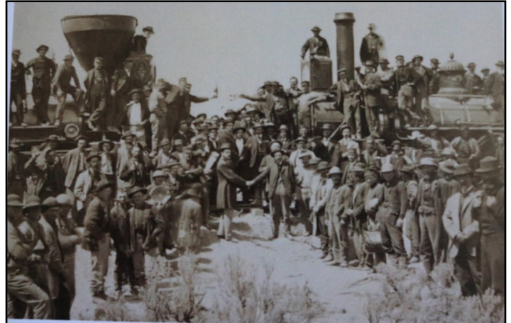
Last Rail Driven, the Golden Spike , for the Transcontinental Railroad, May 10, 1869

On one day I rented a car and drove across the Great Salt Lake flats, past Bonneville Speedway and into Ely, Nevada to visit the Nevada Northern Railway outdoor Museum. The yard and railroad service terminal exist much like they did 70 years ago, with rolling stock and locomotives donated by Kennecott Copper (one of my previous employers in another location). The NN railroad was built to serve Kennecott's mines, concentrator, and smelter in this area. I took many pictures and will be crafting another clinic presentation with