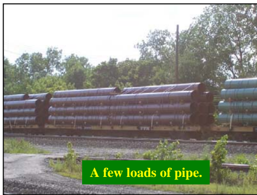
A few loads of pipe.