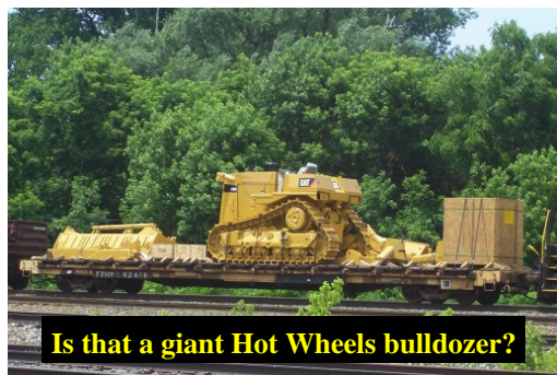
Is that a giant Hot Wheels bulldozer?