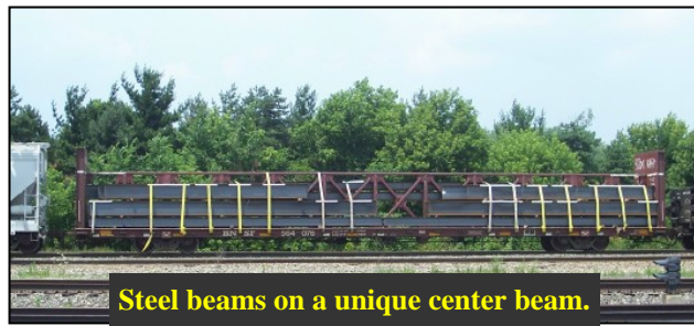
Steel beams on a unique center beam.