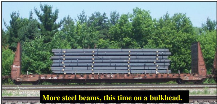
More steel beams, this time on a bulkhead.