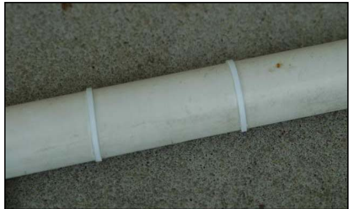
Banding added to pipe