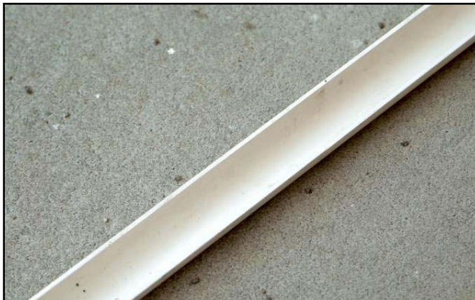
PVC pipe cut to length and size

flatten the round surface and then carefully remove even amounts of PVC along the sides. One note of caution if you do try this method, a jointer works via a very sharp blade that is spinning very fast. Therefore, the use of a rubber surfaced push block is highly recommended so that your fingers aren't pushing down on the plastic and you keep your fingers and hand