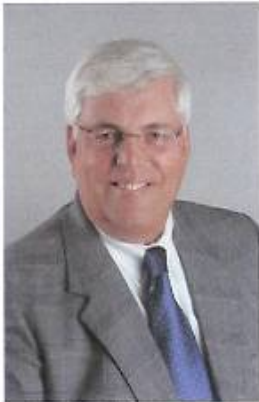
Member NMRA, MCR, Division 5.