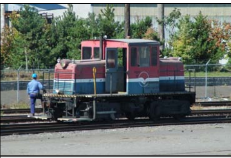
Port of Vancouver 614 critter getting ready to switch lumber flatcars at Port.

next few issues of the Trainwire of various rail activities, whether they're simply unusual or different railroading aspects from what we see here in northeast Ohio, general ideas that you can use for modeling, or finally something related to the more problematic nature of railroading. Hopefully this will get some of the membership thinking about things they've seen and share it with the Division here in the Trainwire. ☘