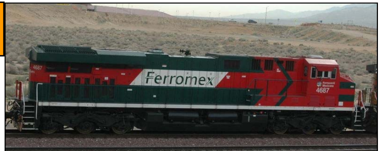
Ferromex 4687, a new ES44AC built at GE Erie, rolls west through the desert at Victorville, CA