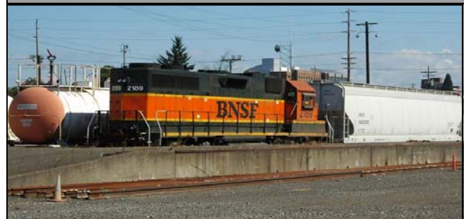
BNSF 2189 spotting cars along an earthen loading ramp within the BNSF Vancouver, WA yard