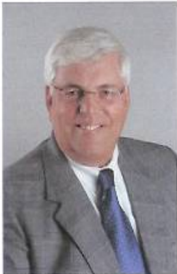
Member NMRA, MCR, Division 5.