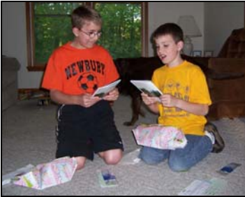
Amtrak tickets to Kissimmee,