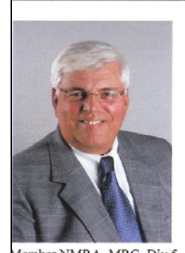
Member NMRA, MRC, Div 5