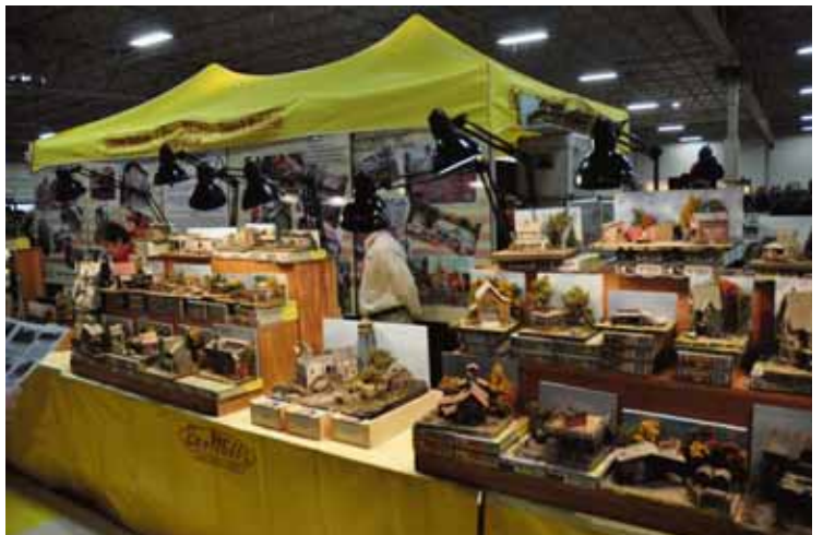
Bar Mills exhibit and products

Our next stop was the Young building, which was marked by a nicely restored speeder setup outside the main doors by the North American Railcar Operators Association. Once inside, such familiar names as Bar Mills, Chooch Enterprises, Carstens, Branch Line Trains, Des Plaines Hobbies, Fox Valley Models, JL Innovative Design, N Scale Architect and Mountaineer Precision Products were displaying their wares, to name just a few. The building also housed some rather large layouts, including three layouts by the