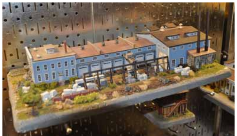
Offerings from N Scale Architect