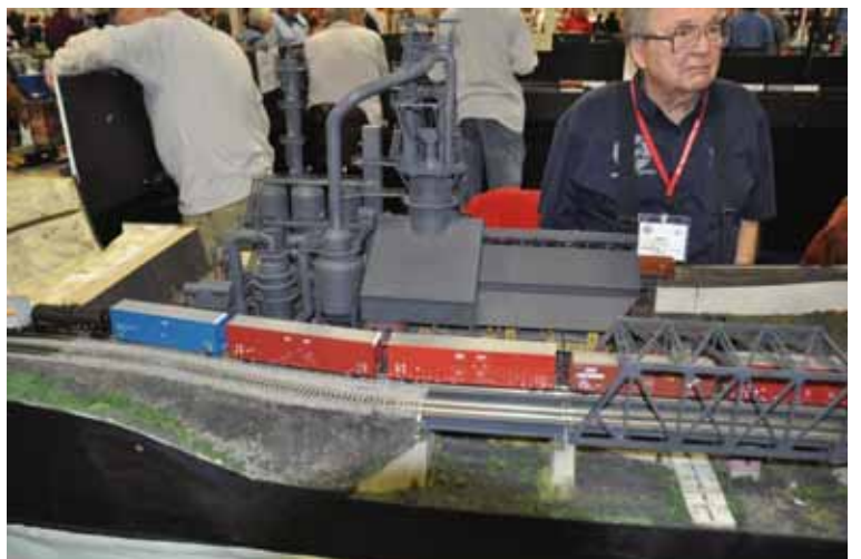
Steel mill on the Hub Division layout