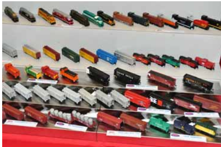
New N scale offerings from Atlas

The show isn't an inexpensive one to attend, with a daily entrance fee of $10 and a parking fee of $5. However, similar to Division 5, the proceeds from the show are used to promote interest in railroads and railroading around the area. According to their website, annual grants and donations have been made to various railroad museums, historical societies, restoration projects and scholarship funds. In addition to those costs, you can also plan to spend additional monies on various food booths, including a few alcoholic libations if you are so inclined.