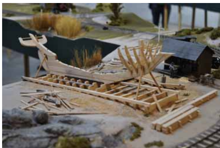
Narragansett Bay Railway & Navigation Company layout

One of the best layouts we saw that day was located in this building, and consisted of the On30 scale Narragansett Bay Railway & Navigation Company. Set in New England, this modular layout narrow gauge RR depicts