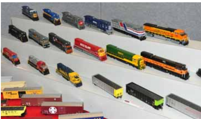
New HO offerings from Atlas