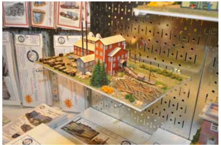
Offerings from N Scale Architect

All in all, this show turned out to be a great way to spend a cold January weekend and I left wishing I could have stayed for the second day of the show. Of course, maybe not attending a second day was OK, as I probably wouldn't have had room in the suitcase and still needed to keep some money available for Railfest 2011.