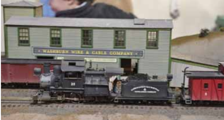
Narragansett Bay Railway & Navigation Company layout

south eastern New England in the 1930's-40s, and used a combination of Bend Track and Free-MO. It was built by members of the Little Rhody Division of the NMRA. All of the power is steam, and the scenery really makes this layout come alive, from the scale coastal steamers to the re-creation of the building of a wooden boat near the rail line.