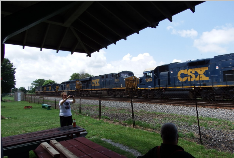
Six Engines passing the Painesville Depot

Publication of Division 5 12049 Sperry Road Chesterland, Ohio 44026