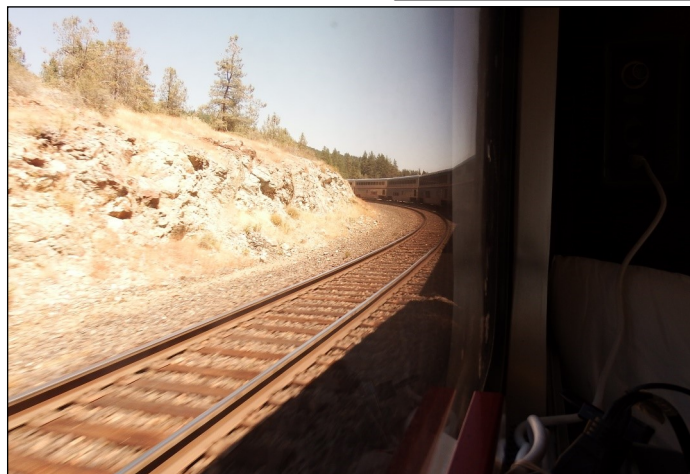
Amtrak on the way to Seattle