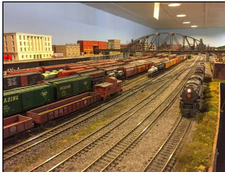
Here is a view of the west end of Altoona yard: