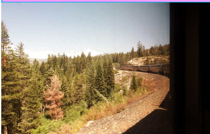
Amtrak in the Beautiful Mountains of Washington

T he Trainwire is always looking for an interesting article. If you have taken a trip lately, seen something interesting trackside, have a particular view point on a railroad subject or just want to participate in the Modelers Corner; then we want to hear from you. Everyone wants to be kept current on Division information, but we all enjoy an interesting article written by a member of this organization. So take your pictures and article and send them to the Editor by email and share them will all of us.