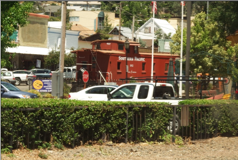
A caboose in a small town in Minnesota

Publication of Division 5 12049 Sperry Road Chesterland, Ohio 44026