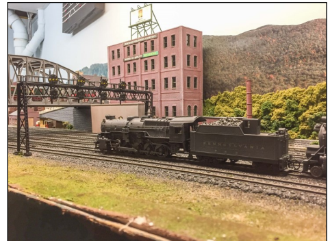
Double-headed I10's on a mineral train wait for a signal at West Altoona yard:

various trains coming into, and leaving, Altoona both westbound and eastbound; including mainline trains, locals, and loaded and empty mineral trains.