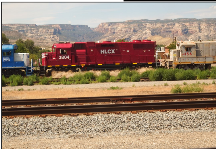
Somewhere in the California Mountains