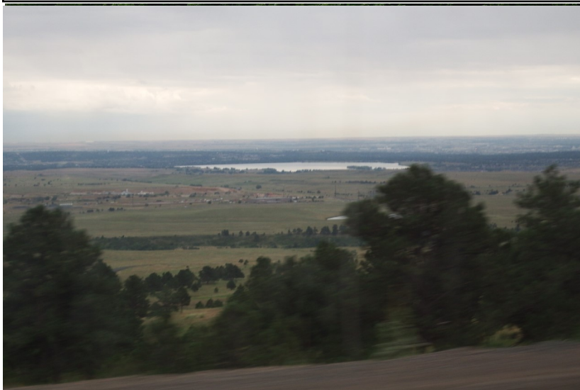
Overlooking Denver, Colorado from Amtrak

Publication of Division 5 12049 Sperry Road Chesterland, Ohio 44026