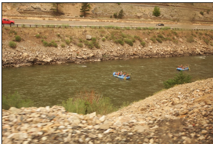
Rafters in the Glenwood Canyon

The proposed changes to the by-laws passed by a vote of 44 to 6.